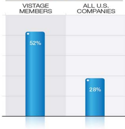
Percent of companies who perform better than their competition